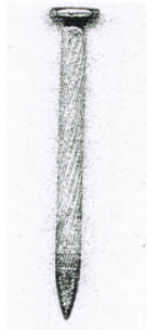
a. Knurled Shank Pin

8 Allowable negative transverse load is for wall assemblies sheathed with gypsum sheathing attached by using knurled-shank power-driven pins on the exterior side of the walls.