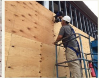
Lath to Densglass to Steel