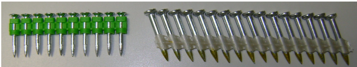
FIGURE 1—JAACO NAILPRO HARDENED BALLISTIC PINS: NP100S (LEFT) and NP145S (RIGHT)